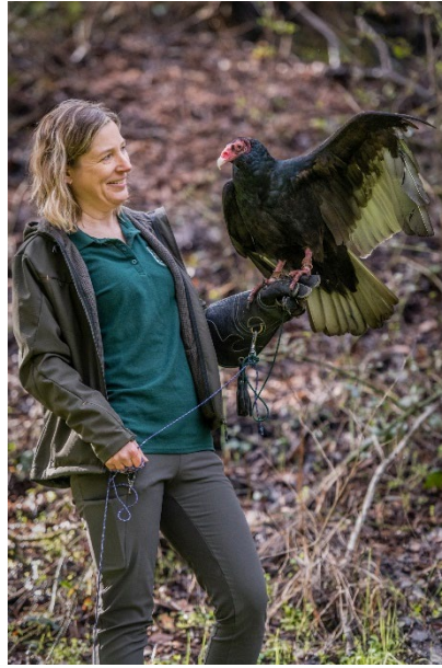
Prince, resident Turkey Vulture, doing a program

Alameda Fish and Game Commission awarded Sulphur Creek Nature Center $10,000 in the spring of 2022. The grant continues to make a great impact on our center, as it supports the overall care for the resident animals. Our center has felt the financial impact in goods and services, as the cost of food continues to rise every year. The grant has helped Sulphur Creek offset the cost of food, veterinary services, and has helped with upgrading our animal enclosures.